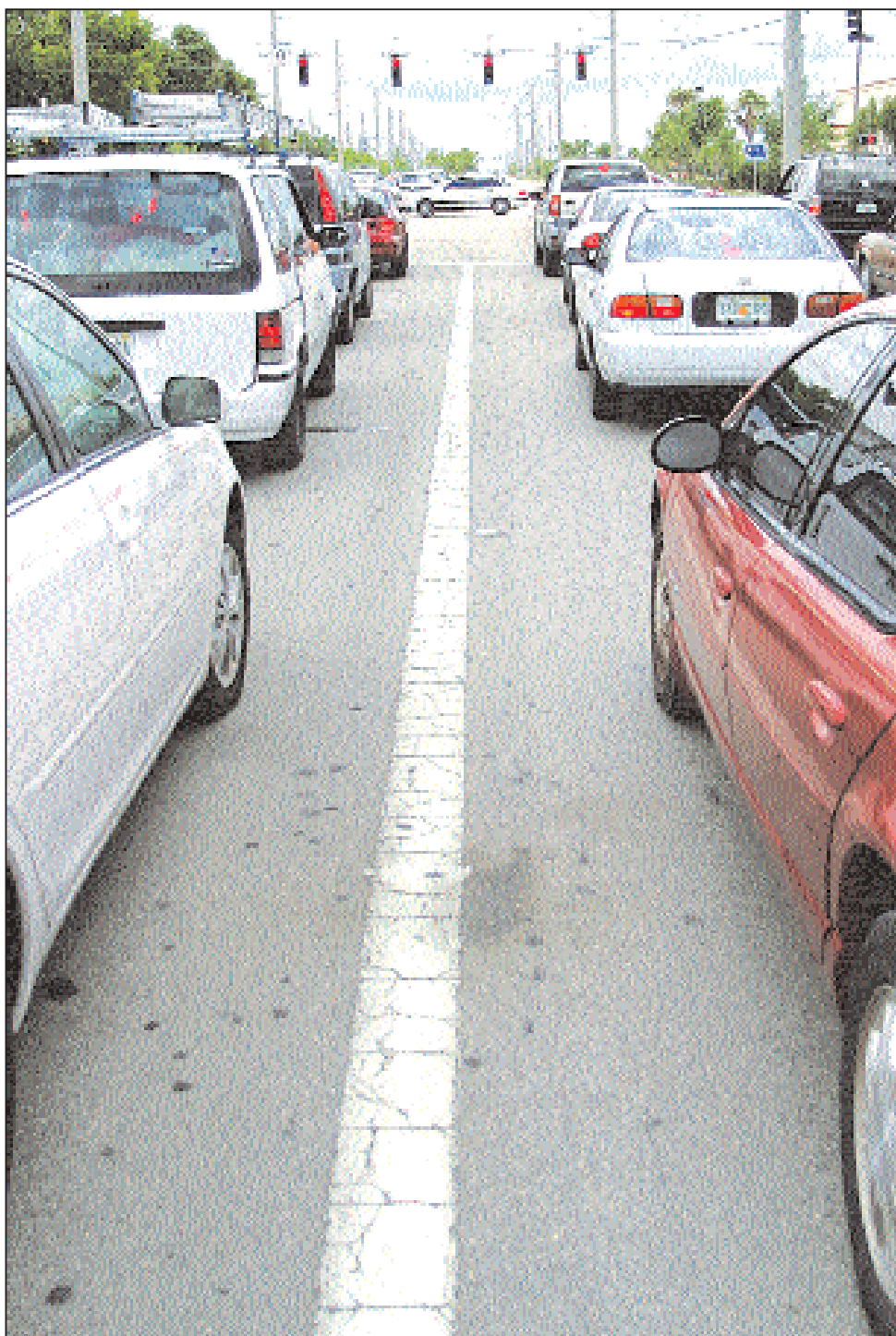
Indian River County commissioners recently discussed the congestion at S.R. 60 and 58th Avenue.